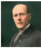
Paul Harris Founder of Rotary