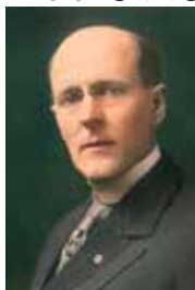
Paul Harris Rotary Founder