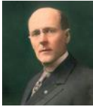
Paul Harris Founder of Rotary