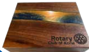
Auction Item #001 Rotary "Bling" Keepsake Box