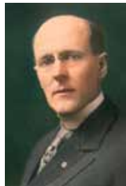
Paul Harris Rotary Founder