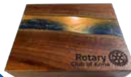
Auction Item #001 Rotary “Bling” Keepsake Box