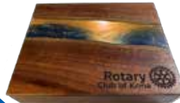
Auction Item #001 Rotary “Bling” Keepsake Box