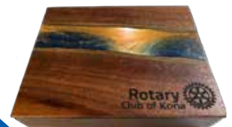
Auction Item #001 Rotary "Bling" Keepsake Box