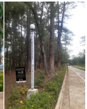
The Rotary Club of Creative City Baguio is our Sister Club.