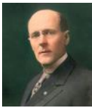
Paul Harris Founder of Rotary