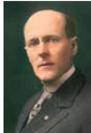
Paul Harris Rotary Founder