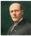
Paul Harris Founder of Rotary